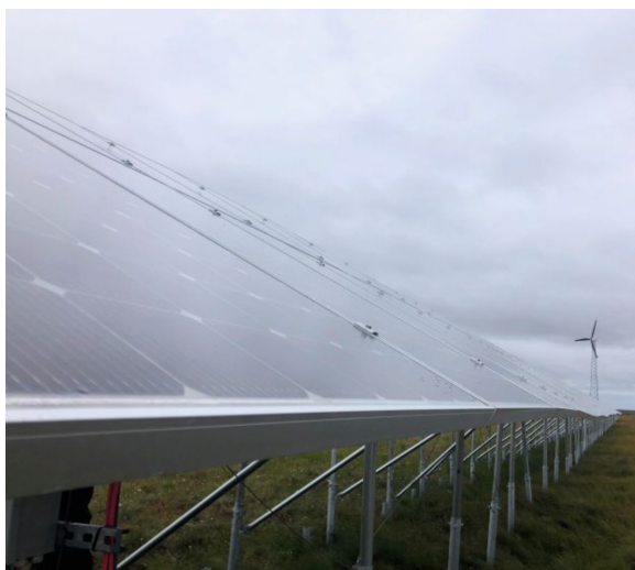
Remote clean energy is a key pillar of climate action

Consultations continue on how best to return the proceeds from the fuel levy to Indigenous communities, which was promised when the policy was implemented more than five years ago.