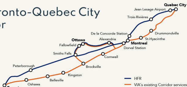
A conceptual map of the high frequency rail project.

Other Announcements: Budget 2024 also announced more funds for the Clean Growth Hub, more incentives for EVs, increased funding to Parks Canada, and a forthcoming establishment of a Youth Climate Corps to give young people work that addresses climate change.