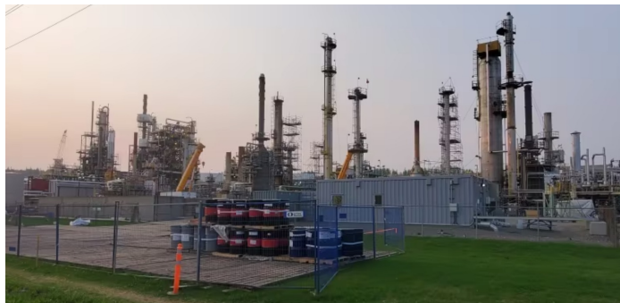
A renewable diesel (biofuel) facility in Prince George, BC.

Carbon Contracts for Differences: The Canada Growth Fund will be the principal federal entity to issue CCFDs, including allocating, on a priority basis, up to $7 billion to issue an expanded range of CCFD offerings. CCFDs can drive investment in clean growth projects because they offer market certainty.