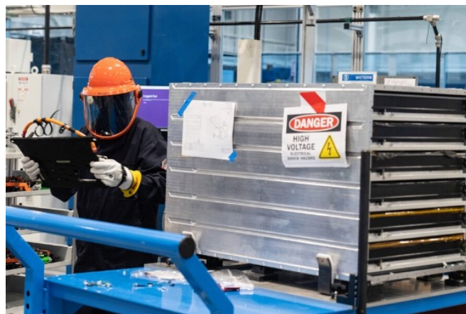
A worker at Lion Electric Company's lithium-ion battery manufacturing facility

Budget 2024 also announces key design and implementation details for the previously announced Clean Electricity Tax Credit . Notably, for provincial and territorial Crown corporations to have access to the credit, they would need to "publicly commit to working towards a net-zero electricity grid by 2035". This is seemingly a response to Alberta and Saskatchewan, whose premiers have vocally opposed the clean grid target.