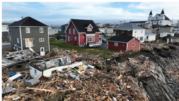
Extreme weather events like Hurricane Fiona are becoming more common.

Biofuels: Budget 2024 announces the government's intention to disburse up to $500 million per year from Clean Fuel Regulations compliance payment revenues to support biofuels production in Canada. Furthermore, the Canada Infrastructure Bank will invest at least $500 million in biofuels production.