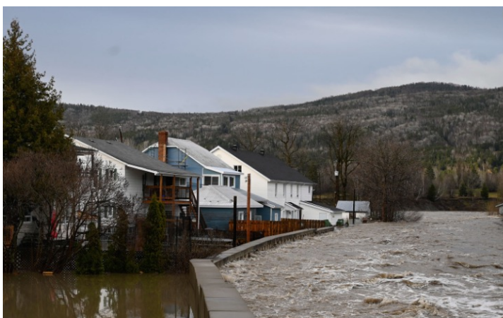
Nearly 1 in 10 Canadians live in high flood risk areas

Though a long awaited Permanent Public Transit Fund was not announced in this budget, Budget 2024 announces certain measures to support gentle urban densification , like eliminating all mandatory minimum parking requirements within 800 metres of a high-frequency transit line. This measure reduces car-use in cities, encouraging public transit use instead.