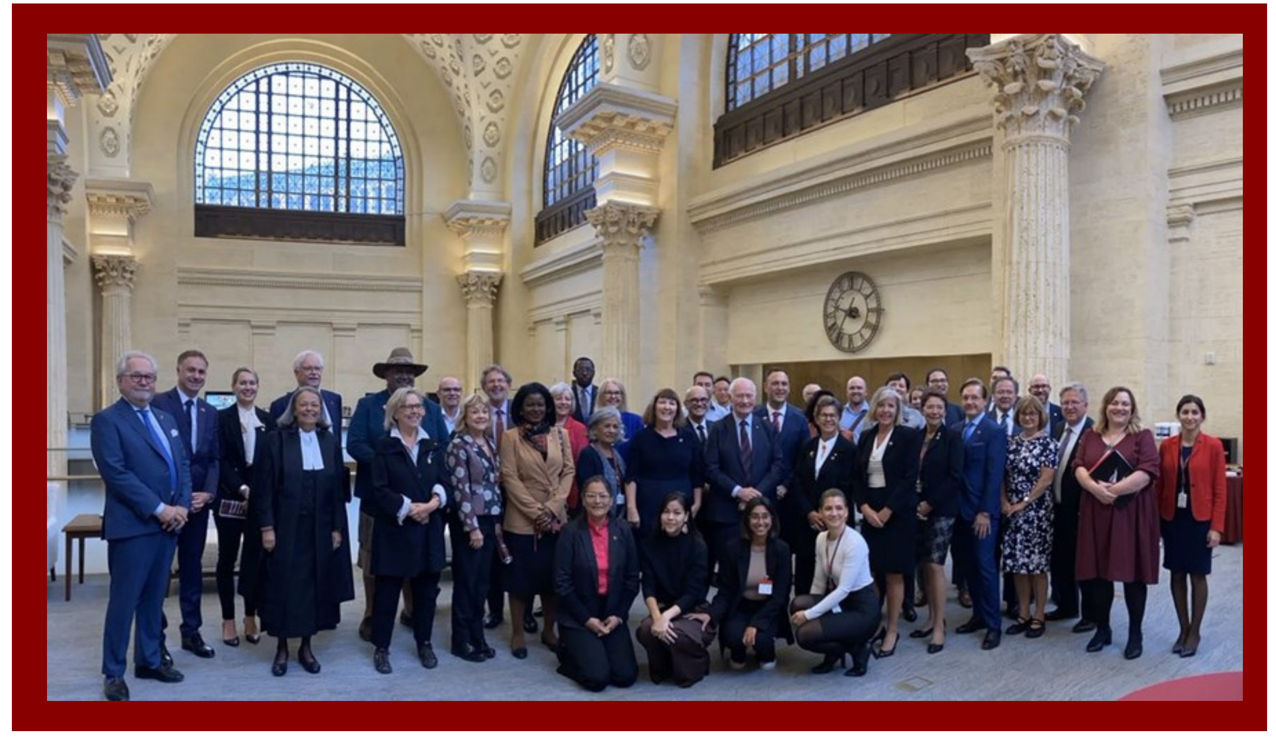
Official launch of Senators for Climate Solutions